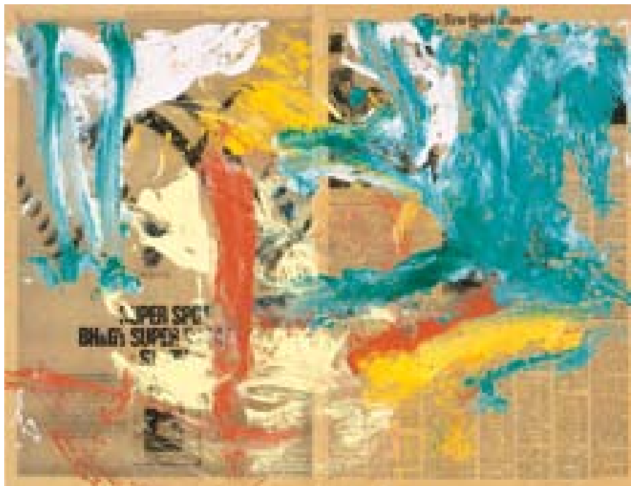
Willem de Kooning | ohne Titel | 1970

We are active in all areas of civil law. In particular, we provide advice regarding the law concerning persons, associations, foundations, marriage, family, inheritance and property. We also work in all areas of contract law (including, inter alia, sales, rental, labor law and employment agreements, mandates,