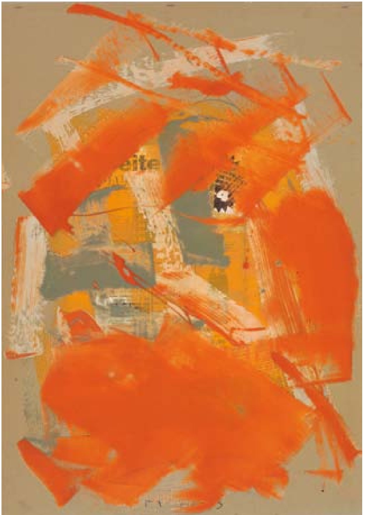
Imi Knoebel | Entscheidung | 1983