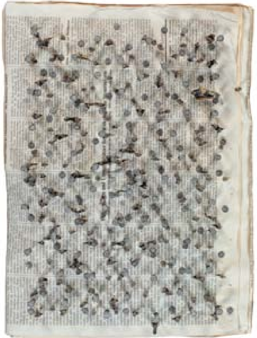
Günther Uecker | Zum Schweigen der Schrift | 1994

At Nobel and Hug, we provide advice to companies and organizations with regard to strategic planning as well as in the structuring and financing of complex legal transactions. This encompasses, among other things, the planning and preparation of takeovers, including the search for target companies; rendering advice and support with respect to the development of new business branches; the development of optimal corporate