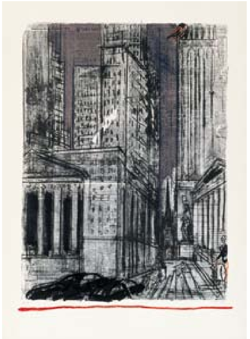
Varlin | Wall Street | 1970

Our firm advises issuers and market participants with regard to public offerings and all aspects of compliance with the Swiss Federal Act on Stock Exchanges and Securities Trading.