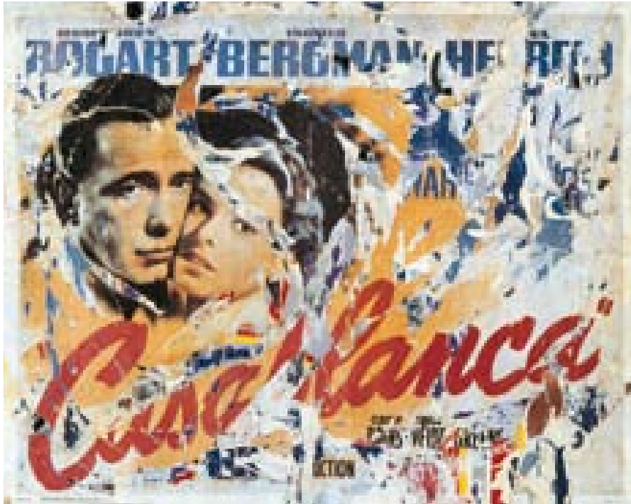
Mimmo Rotella | Casablanca | 1963

In the area of intellectual property law (e.g., copyright and trademarks, industrial secrets etc.), our clients are provided with the advice of attorneys specialized in the field; the latter are also at our clients' disposal with respect to the enforcement of intellectual property rights. Such specialized know-how enables us to competently support our clients