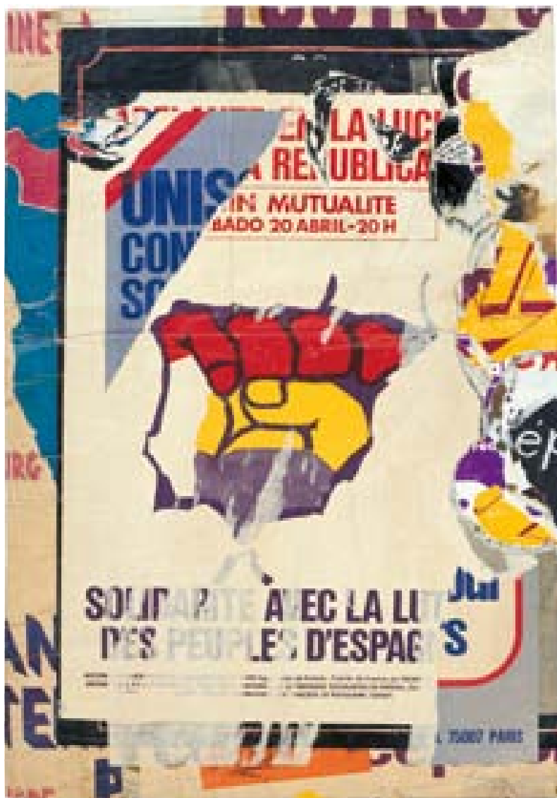
Raymond Hains | Solidarité | 1974

In today's economy, the field of tax law has become highly complex and specialized. Due to this factor, we have come to the conclusion that we can offer our clients the best possible services in this area by working with outside specialists in the field.