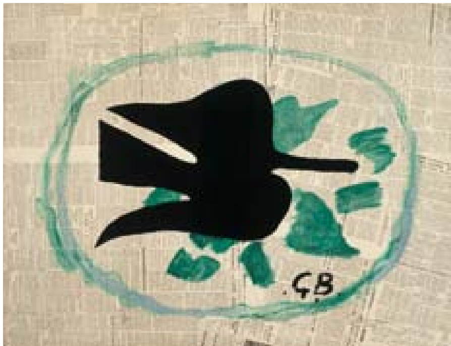
Georges Braque | L'Oiseau dans le Feuillage | 1962

Our team not only includes active pilots and board members of aviation companies, but also members of various commissions regarding aviation law.