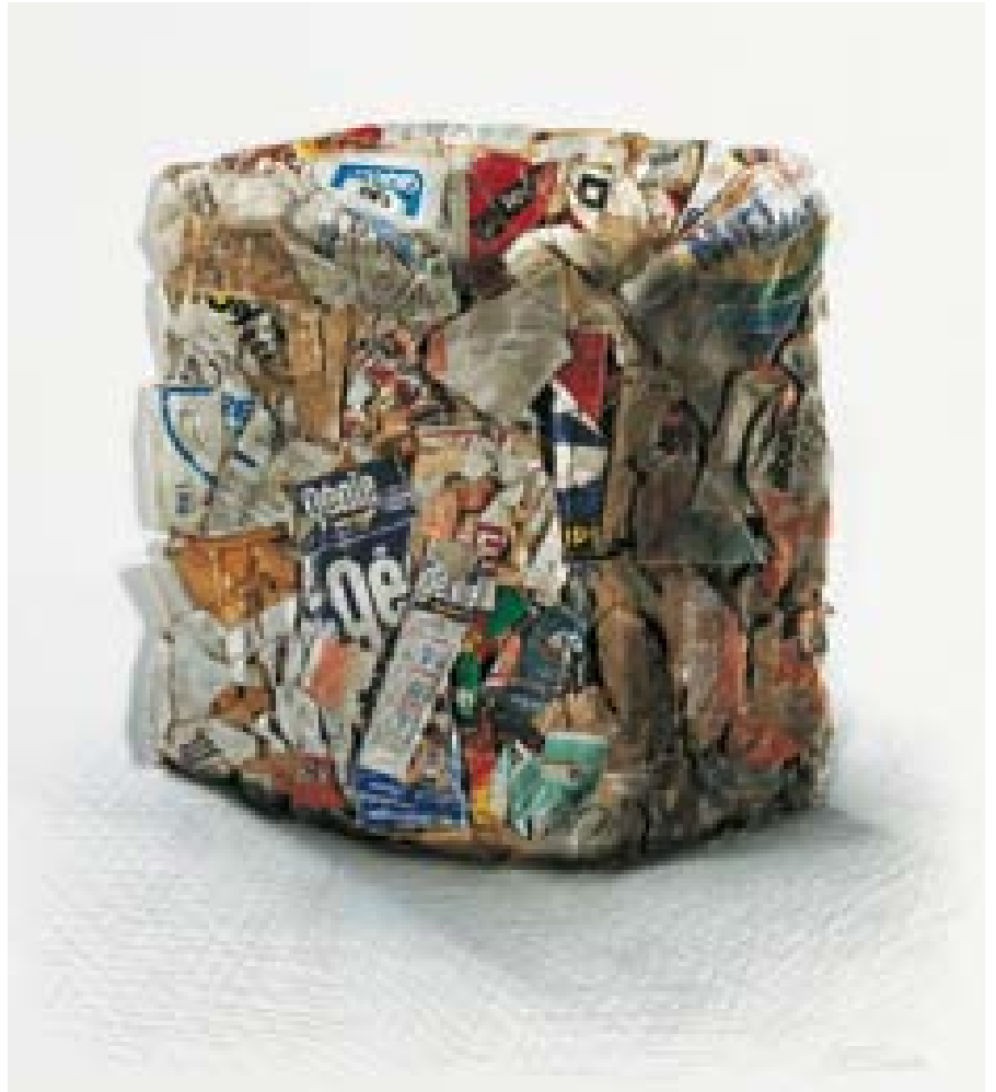
César | Papierabfälle | 1980

We provide counsel in various areas of insurance law to members of the insurance industry. Matters handled include regulatory representation and representation of insurers or insured(s) in disputes.