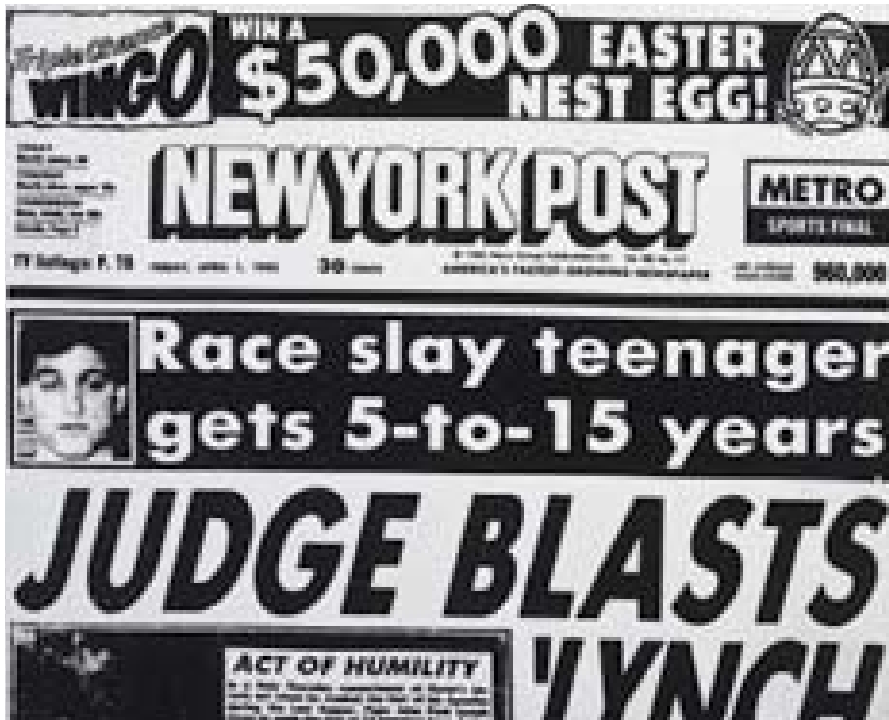
Andy Warhol | News | 1983