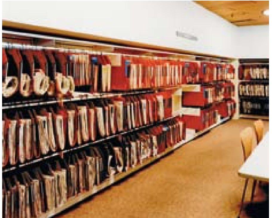
Candida Höfer | Palos Verdes Library | 2000

We counsel our clients on all questions arising in connection with debt enforcement and bankruptcy law (e.g., concerning bankruptcy proceedings or liquidations).