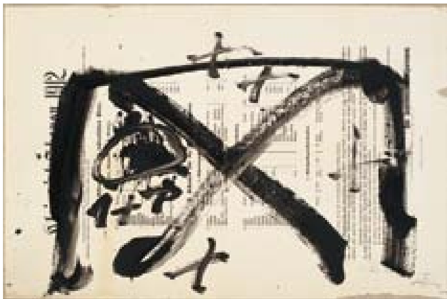
Antoni Tàpies | Le Marché | 1990

Our attorneys are regularly engaged in representing banks, financial intermediaries, insurance companies and other providers of financial services regarding all regulatory matters and administrative