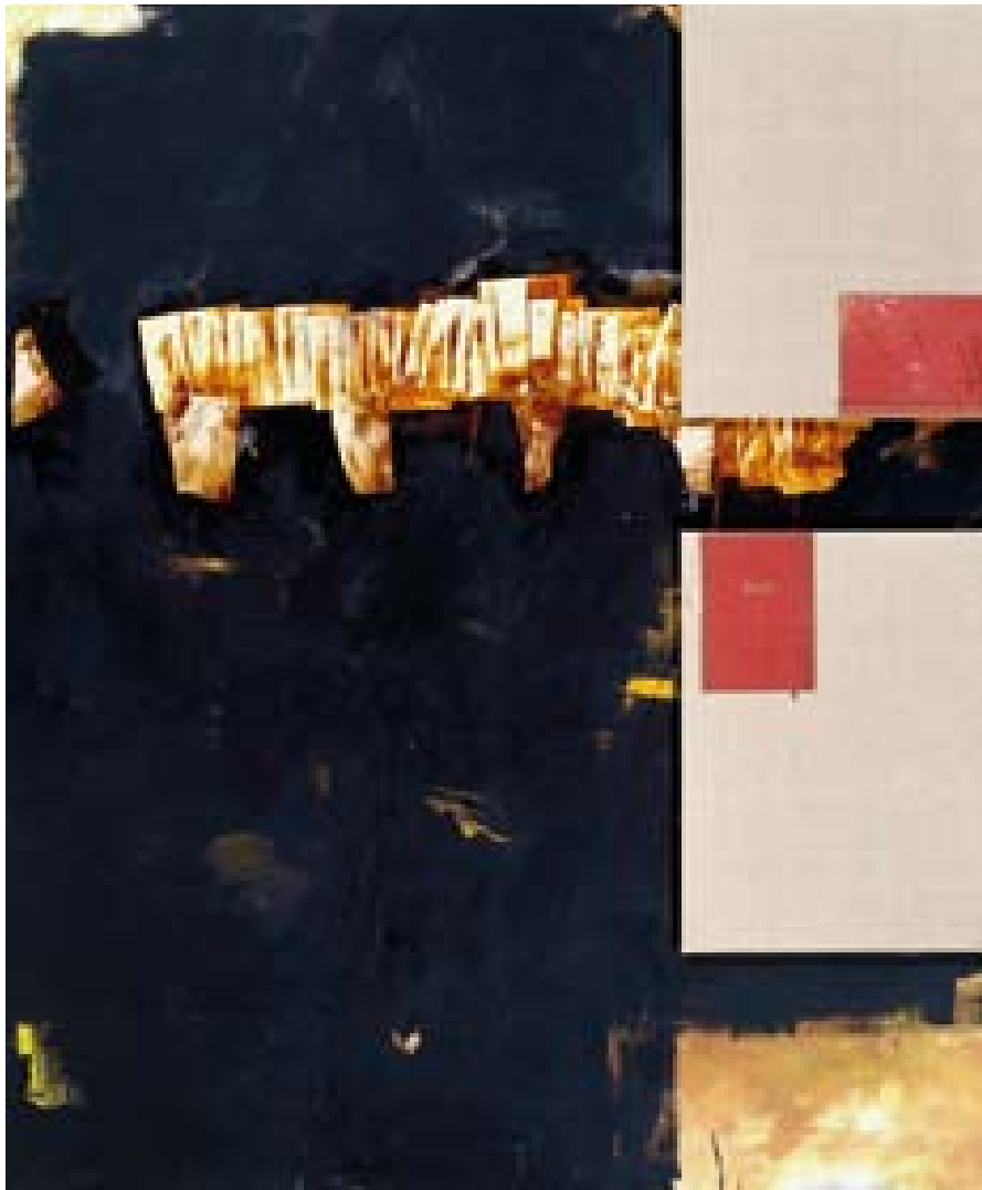
Andres Gruner | Der Richter und sein Henker | 1992

Our practice extends to all aspects of white collar crime and the procedural aspects of criminal and administrative litigation, whether for clients targeted for investigation or clients actually charged with criminal offenses (e.g., insider dealing, share manipulation, breaches and/or violations of disclosure regulation, money laundering etc.).