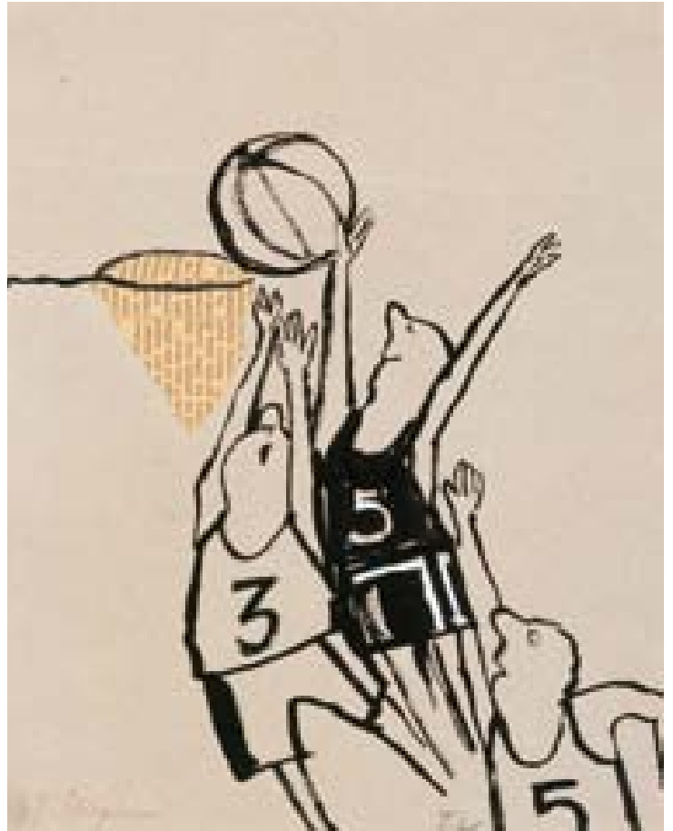
Tomi Ungerer | ohne Titel | 1960

Our professional activities also encompass various aspects of European Union law (in particular, in the areas of corporate and capital market law, intelle-