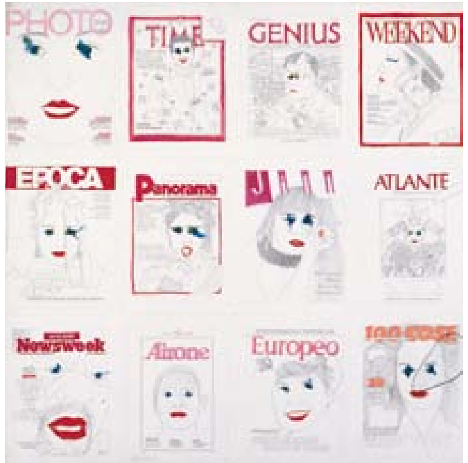
Alighiero Boetti | ohne Titel | 1985

We are actively involved in client representation on various issues regarding the press, photography and advertising, which arise under media and communication law. Our attorneys advise publishers, photographers, photographic agents, archives, associations and other