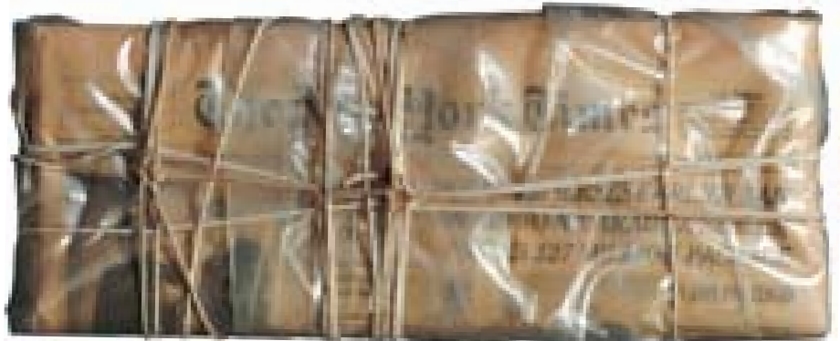
Christo | Wrapped New York Times | 1985

Nobel & Hug was founded in 1982 and has since grown to a middle-sized law firm. Our firm engages in both national and international mandates and projects. We view legal counseling as an individual act of confidentiality and believe that irrespective of the size of a law firm, an efficient problem solution can, in most cases, be reached by 2 to 3 persons. A majority of our attorneys speak at least three European languages: in addition to the working languages, German, French and English, other languages spoken include Italian, Spanish, Portuguese and Russian.