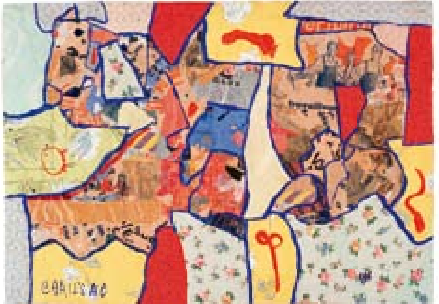
Gaston Chaissac | Collage sans Visage | 1963

We provide practical advice in dealing with the numerous human resource issues (including questions concerning pension funds) which