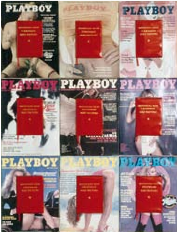
Denmark | Playboy-Mao | 1979 - 80

The protection of personal rights of individuals and legal entities is an area of law in which we have engaged in heavily since the foundation of Nobel & Hug. In this field, we advise and represent clients who have faced invasions of their personal privacy by publications in the press or in advertising. In cases of libel or slander, criminal measures may have to be taken. Attorneys at Nobel & Hug represent clients in state courts regarding both civil and criminal actions and in special board or committee hearings in the media and advertising industry.